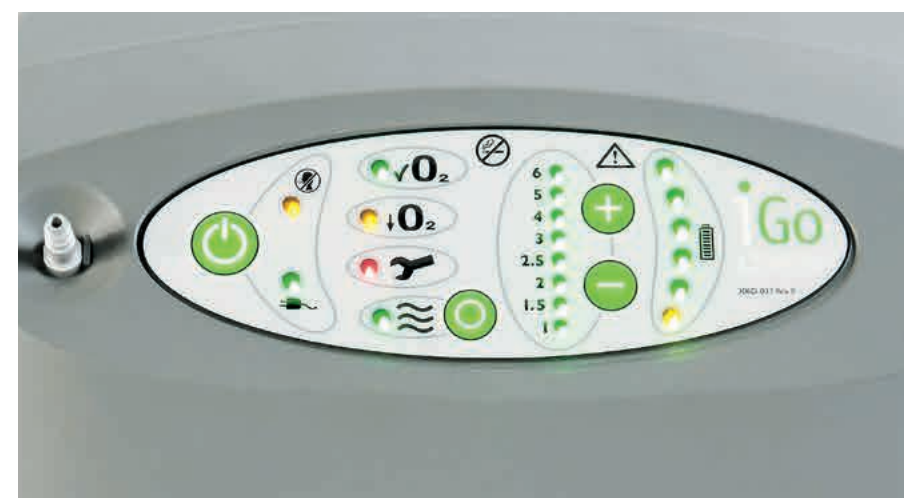
iGo control panel