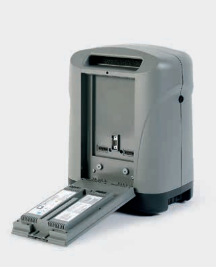
Rechargeable lithium ion battery