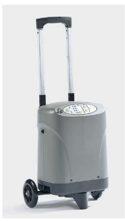
iGo with cart 306DS-626 (cart only)