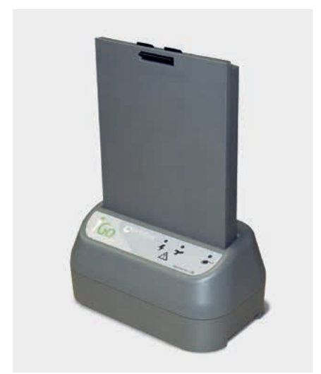
Optional Battery Charger

The optional battery charger not only provides users with added flexibility when travelling, but also allows a second battery to be charged whilst the first is in use. The battery charger is supplied with multiple power cords making the iGo suitable for use worldwide.