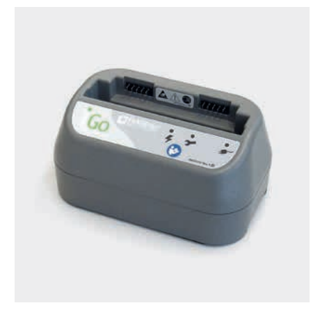
Battery charger 306CH