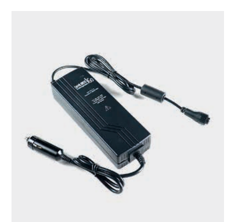
12V DC adapter 306DS-652