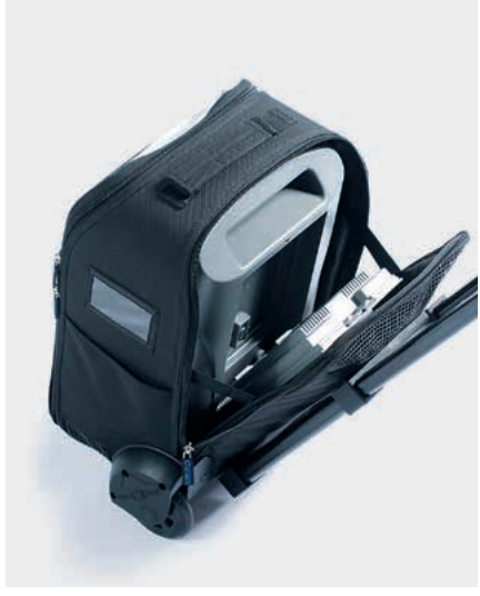
Battery easily accessible