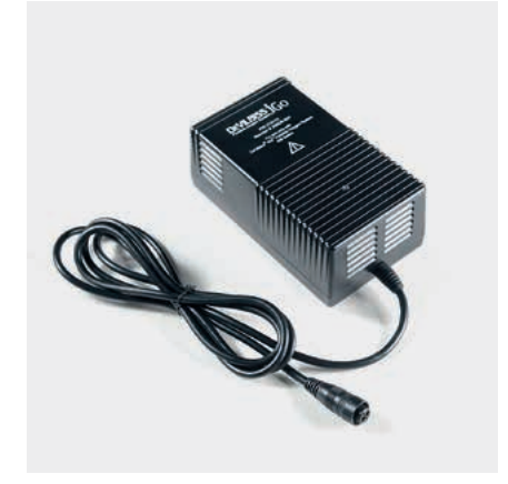
AC 230V power adapter 306DS-651