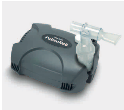
PulmoNeb compressor nebuliser