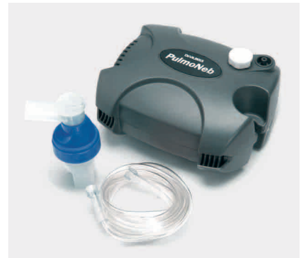
PulmoNeb with reusable Neb800