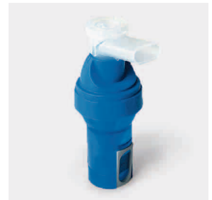
Neb 800 – optional reusable nebuliser