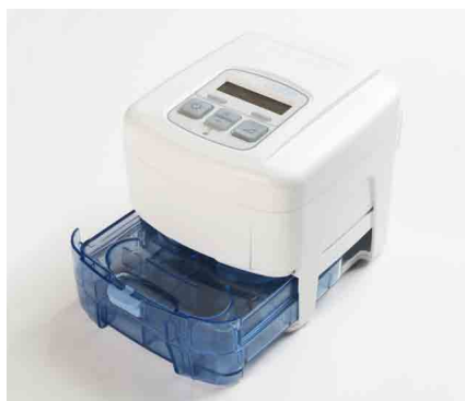
SleepCube with integrated heated humidifier