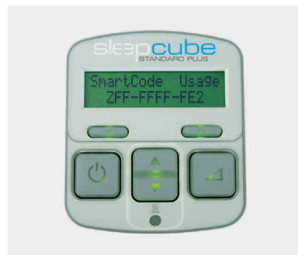
SleepCube with SmartCode display