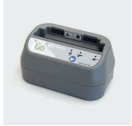
Battery charger 306CH