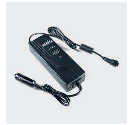
12V DC adapter 306DS-652