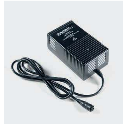
AC 230V power adapter 306DS-651