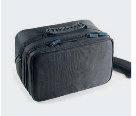
Detachable accessory bag 306DS-655

DeVilbiss Healthcare Ltd. Unit 3, Bloomfield Park, Bloomfield Road Tipton, West Midlands DY4 9AP United Kingdom Phone + 44 (0) 121 521 3140 Fax + 44 (0) 121 521 3141 www.devilbisshc.com enquiries@devilbisshc.com