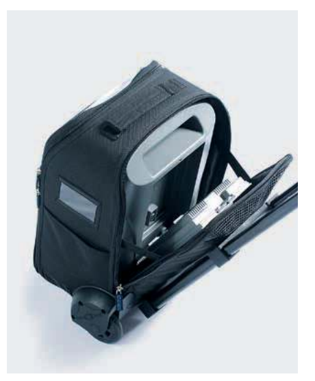
Rechargeable lithium ion battery