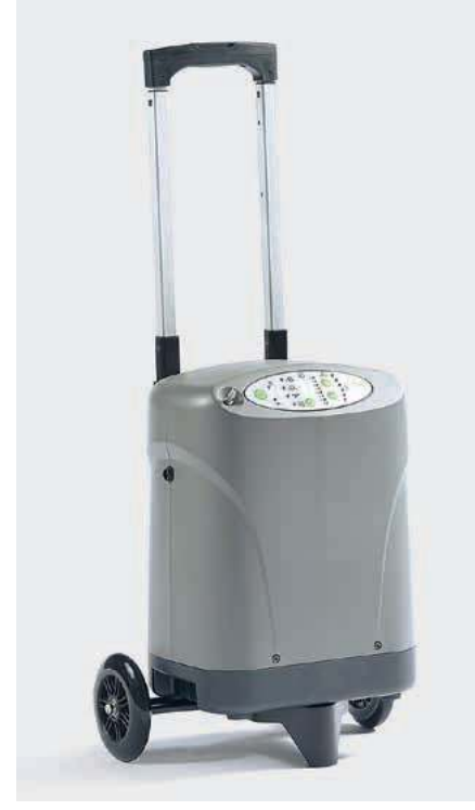
iGo with cart 306DS-626 (cart only)