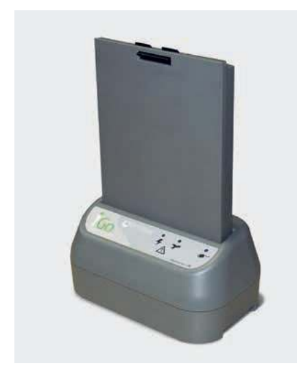
Optional Battery Charger

The optional battery charger not only provides users with added flexibility when travelling, but also allows a second battery to be charged whilst the first is in use. The battery charger is supplied with multiple power cords making the iGo suitable for use worldwide.