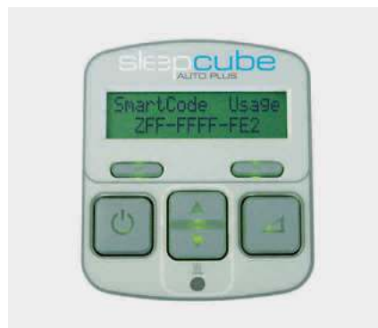
SleepCube with SmartCode display