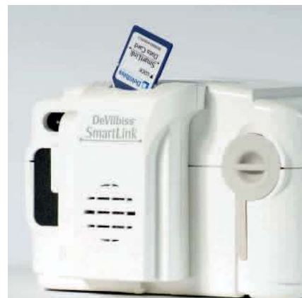
SleepCube AutoBilevel with SmartLink unit attached