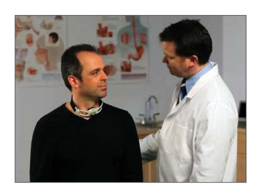
Step 8 - REVIEW EXPECTATIONS WITH THE PATIENT BETWEEN FITTING AND FOLLOW UP VISIT – As with any new device, it may take a week or so for the patient to get used

Once the REZA BAND is fitted, have the patient take it on and off a few times to ensure correct positioning and operation of the Clasp and Comfort Dial. Any further adjustments by the patient while at home can be done using the Comfort Dial.