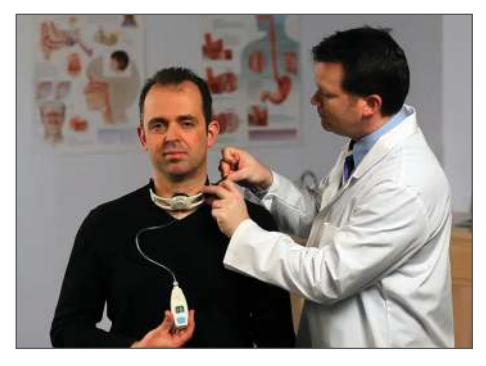
Step 4 - FIT THE REZA BAND

Attach the Pressure Sensor to the External Manometer. Place the Pressure Sensor over the cricoid area right below the laryngeal prominence or Adam's apple. With the Clasp, re-apply the REZA BAND so the Cushion is aligned directly over the Pressure Sensor and is located over the cricoid area.