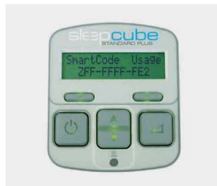
SleepCube with SmartCode display