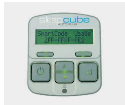
SleepCube with SmartCode display