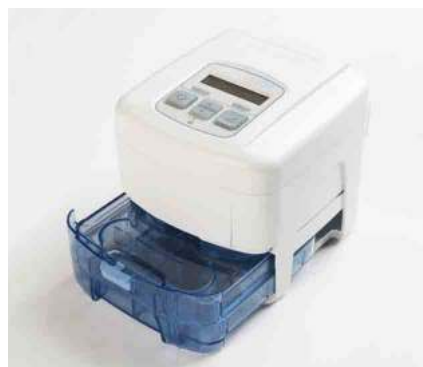
SleepCube with integrated heated humidifier