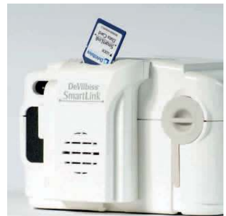
SleepCube AutoBilevel with SmartLink unit attached