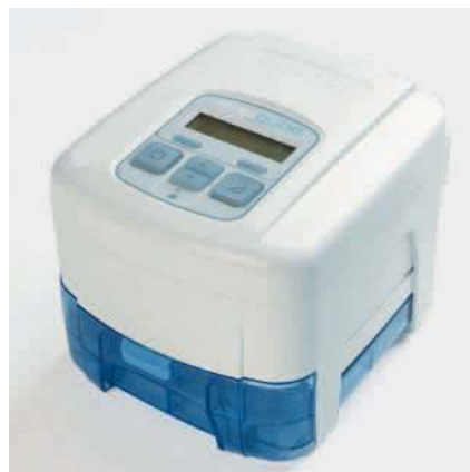
SleepCube with integrated heated humidifier